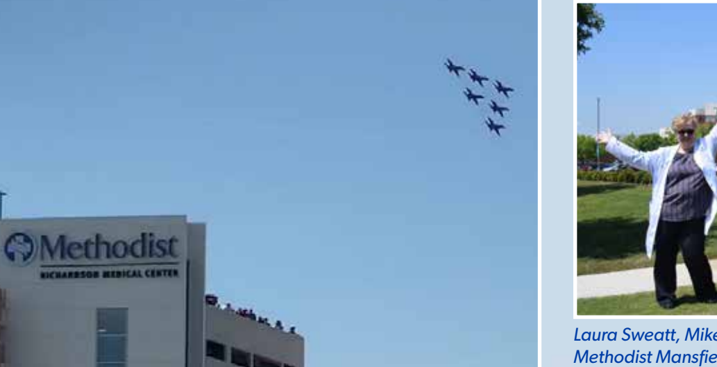
U.S. Navy's Blue Angels flew over Methodist Richardson to show support for frontline workers.