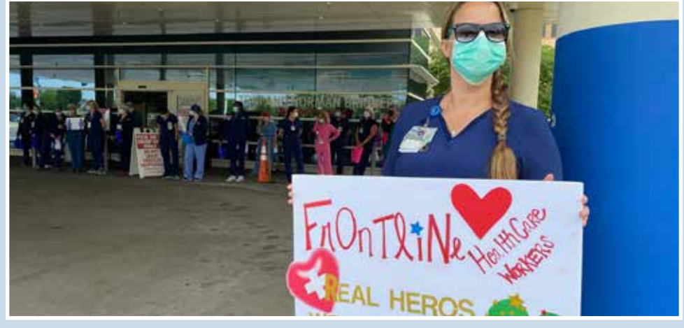
A nurse holds up a sign supporting frontline workers at Methodist Dallas.

It's because of your generosity and support to each of our hospitals and to Methodist Foundation during these unpredictable times that our healthcare team, patients, and community continue to see and experience Methodist Health System's mission to improve and save lives through compassionate, quality healthcare.