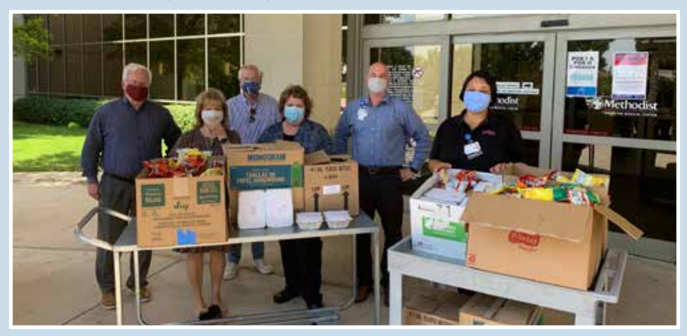
A community member donated meals for the frontline workers at Methodist Charlton.